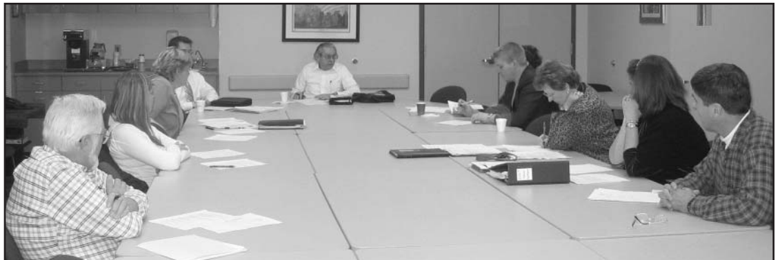
Canteen committee members discuss the 2007 event plans at their November meeting.